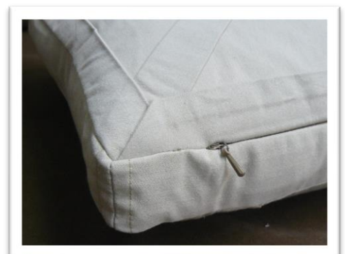
Boxed pillows with no trim