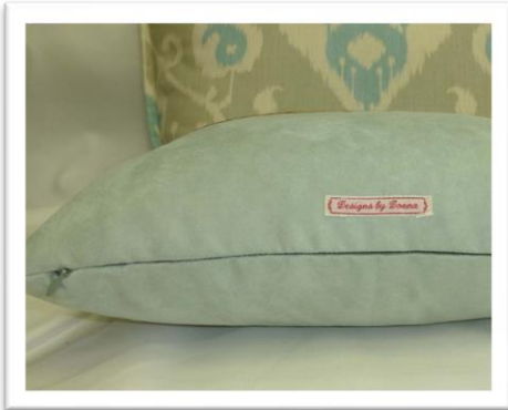
Knife edge pillows with no trim

Note: When an invisible zipper is sewn, the only thing that shows is the zipper pull.