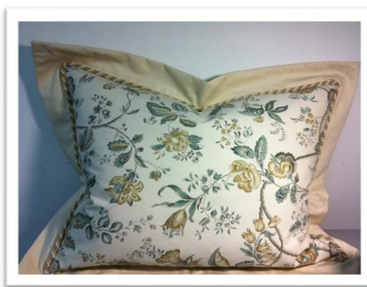
Flange on pillow wraps from pillow back to pillow front