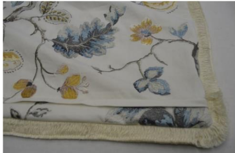
Use a 'zipper strip' to insert the zipper above the seam