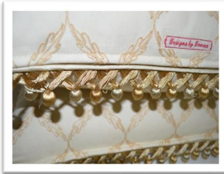
The flap does not cover the welt