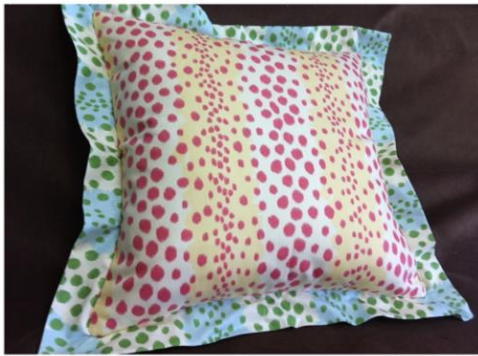
Pillows with contrast mitered flange