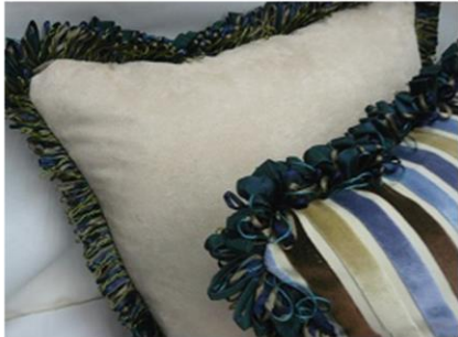
Knife edge pillows with brush fringe