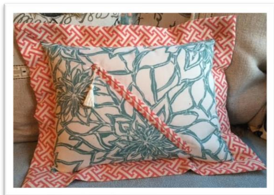
Use a bound zipper as a functional embellishment