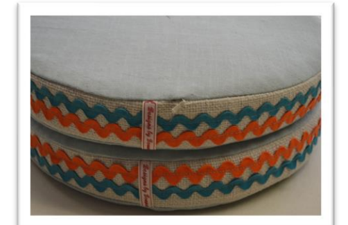
Boxed pillows with no trim