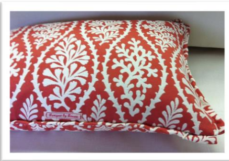
Knife edge pillows with flat flange