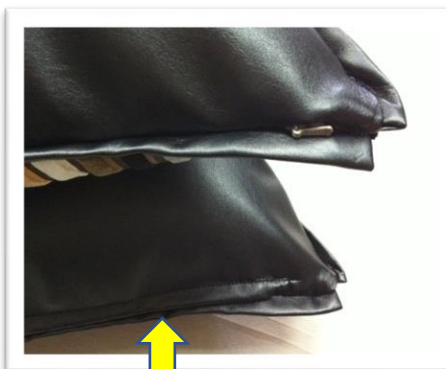
This flap covers too much of the flat welt