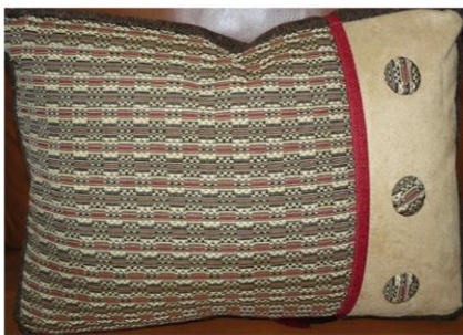
Boxed pillows with trim

And then, get creative with techniques once you understand the method.