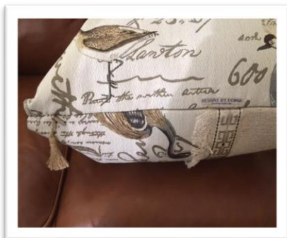
Knife edge pillows with trim