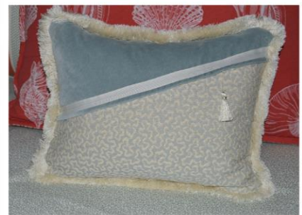
Diagonally placed lapped zipper