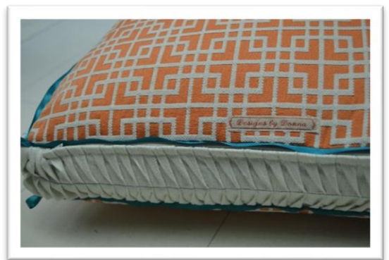
Breaking away from the norm.....