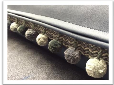
Zipper in vinyl - no ironing, no pinning, I just got lucky!