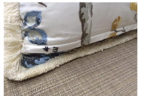
A lapped zipper inserted along the bottom of a pillow