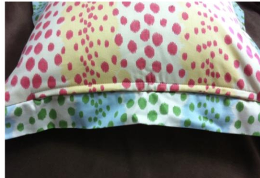
The lapped zipper is inserted between the flange and the pillow back