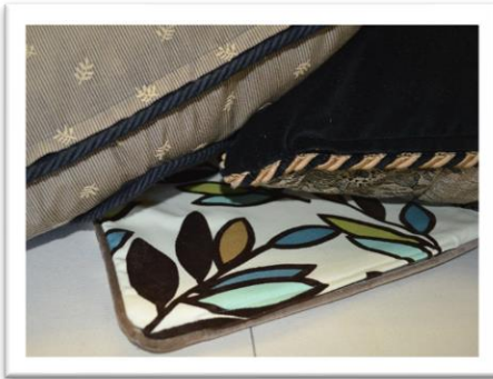
Folded flap covers the zipper