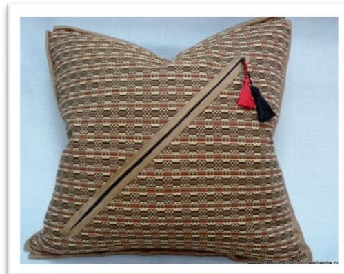
Use a bound zipper in any type of pillow!