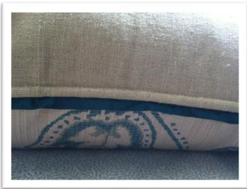
Folded flap covers the zipper