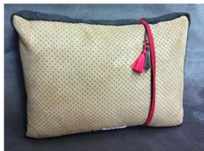
Zipper hidden by decorative band