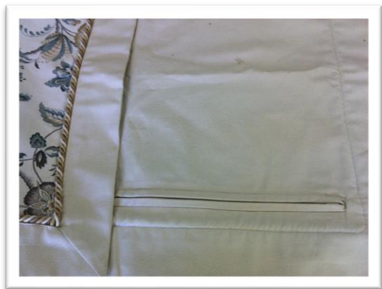
Bound zipper above the flange on pillow back