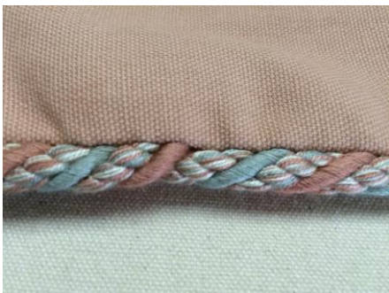
The completed join.